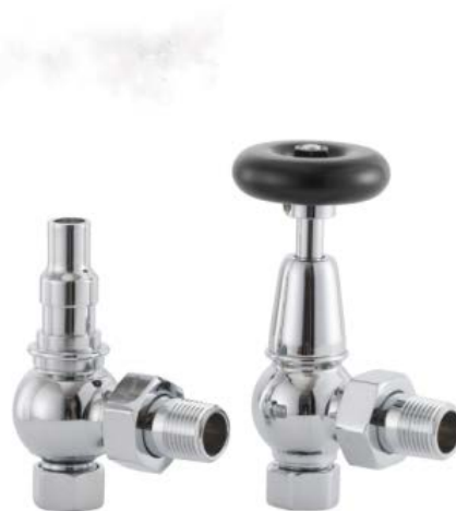
Lock shield valve

Kvs value is the metric measure for the flow of a fully opened valve. It is defined as: The volume flow in cubic metres per hour of water at a temperature of between 5° and 40° celsius with a pressure drop across the valve of 1bar.