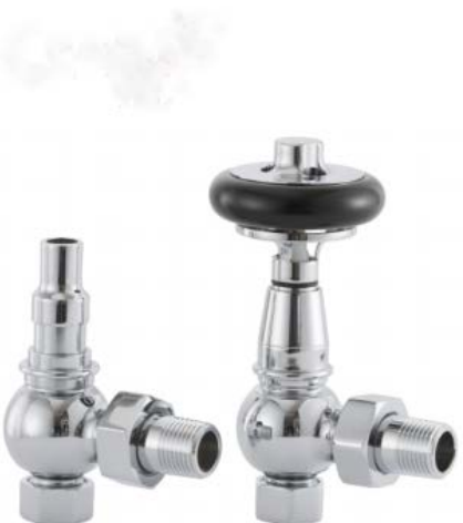
Lock shield valve

Kvs value is the metric measure for the flow of a fully opened valve. It is defined as: The volume flow in cubic metres per hour of water at a temperature of between 5° and 40° celsius with a pressure drop across the valve of 1bar.